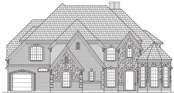
Elevation "A" (Stone Optional)